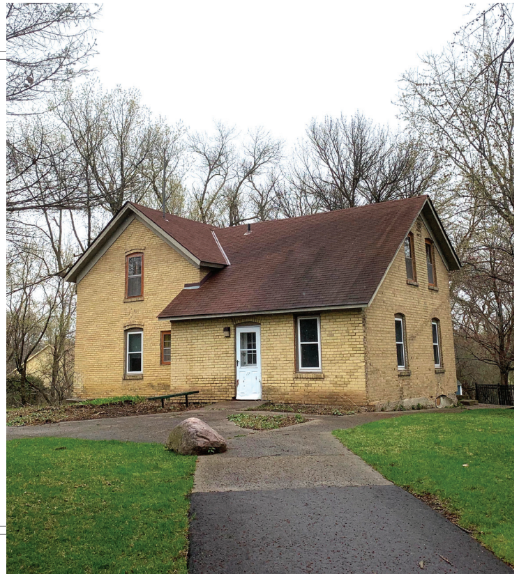
The exterior of the Eitel House.